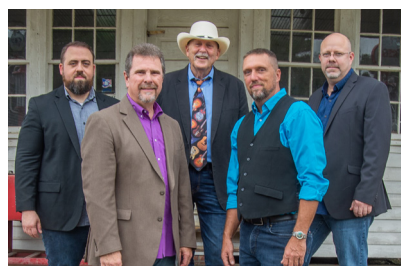
A DEEPER SHADE OF BLUE AUGUST 18