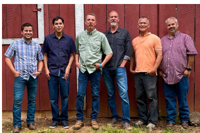
CABARRUS STATION JULY 21

UNIONVILLE COMMUNITY CENTER THURSDAY JULY 21, 28 • AUGUST 4, 11, 18 • 7-9pm