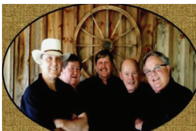
THE VILLAGE GREENE BAND JULY 28